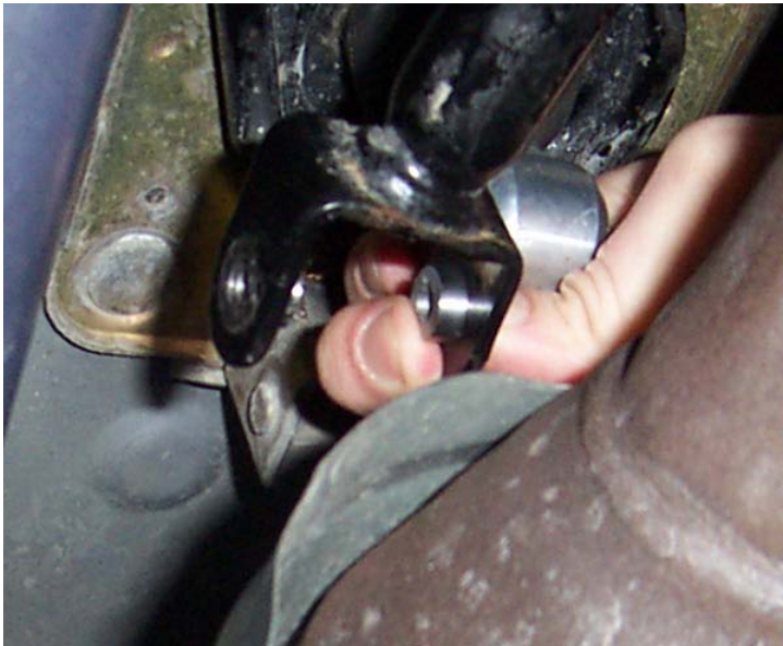
Pictured above: The bushings seated in the shift rod before the shifter base is inserted between them. Note that the smaller shoulders are inserted in to the bolt holes on either side of the shift rod before the bolt is inserted.

15. Raise the car and re-assemble the shift linkage using the hardware included in the kit. Refer to the pictures below for correct orientation of the hardware in relation to the shifter and shift rod. Place one 1/4" inch washer on the bolt before threading through the shift rod and shifter. The stainless steel spacers included in the kit must be installed on either side of the shifter's bearings. Their orientation is very important and illustrated in the pictures below and on the next page. The shouldered spacers must have their smaller shoulder diameter inside the bolt holes in the shift rod and their larger diameter flat face against the shifter bearings. Please note that the bushings smaller diameter shoulders are of different sizes. The larger diameter shouldered bushing goes on the driver's side of the shift rod and the smaller diameter shouldered bushing goes on the passenger side. Once the bushings are in place and the bolt and washer are threaded through the shift rod, bushings, and shifter, place a 1/4" inch washer on the bolt followed by the new lock washer and nylon lined nut. Tighten the nut and bolt using a 7/16" socket while holding the bolt with a 7/16" wrench to remove any gap between the bearings and bushings. Do not over tighten.